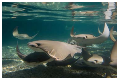
Stingray Bay – 2007 and 2008